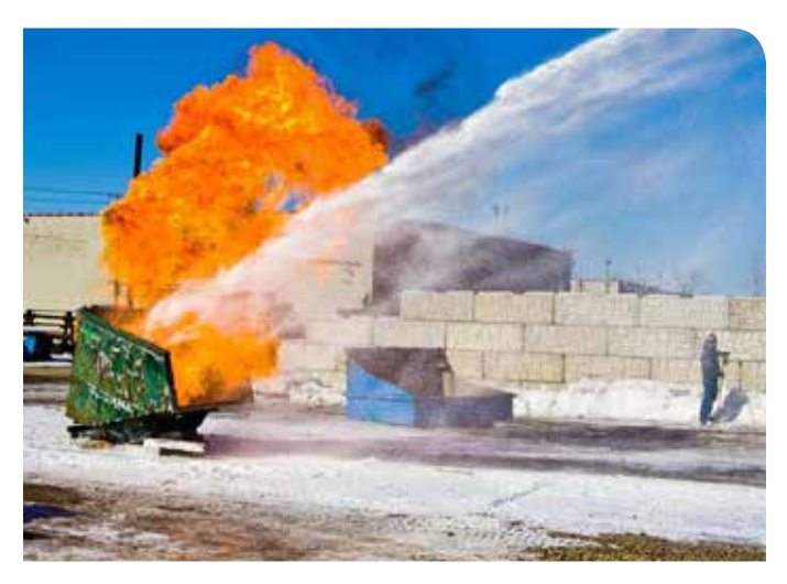
During a controlled demonstration of the Fire Rover's firefighting capabilities, the Watchdog Security team set fire to jet fuel in open metal bins. The FLIR A310f thermal camera instantly detected each fire, triggering a visual alarm (marked in red above). An operator using a laptop then aimed and released the Fire Rover's fire-fighting foam, extinguishing the fires in seconds.

the A310f ignores visible light, it works equally well day or night.